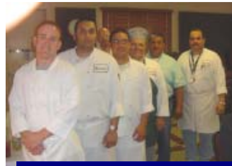
Some of the Chefs-in-Training who prepared the delicious meal that was served at the Rescue Mission